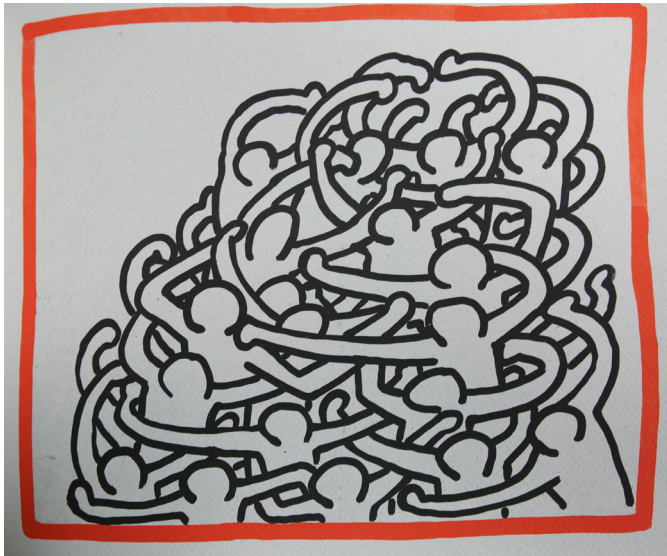
Keith Haring (American, 1958-1990), Against All Odds , 1990. Artist book. Edition AP 5 of 30. Tampa Museum of Art, Gift of The Rubell Family Collection, Miami, 2007.001.