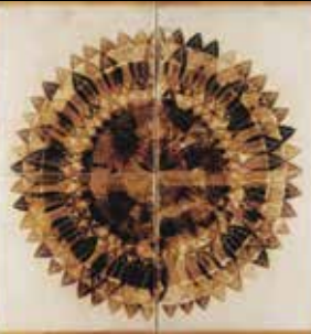
Image credit: Betty Woodman (American, 1930–2018), Sensuous Triptych , 2000. Glazed earthenware, epoxy resins, lacquer, and paint. Tampa Museum of Art, Museum Purchase through the bequest of Julia M. Flom, 2001.011.a–c

From antiquity through the present day, artists and craftsmen have found inspiration in the flora, fauna, and other forms of the natural world. For many artists, the vase in particular has lent itself to flourishes borrowed from nature, often together with – or in the form of – flowers and birds. While the forms and functions of the resulting artworks vary widely, from emulations to adaptations, and from aesthetic beauty to utilitarian purpose, all share a common inspiration worth exploring more closely. From the embrace of natural forms by artists associated with Art Nouveau – a movement only recently reconnected by scholars to the classical tradition – to more complex representations of vases, birds, and flowers by post-war and contemporary artists, Inspired by Nature will illustrate the beauty and vitality of the natural world alongside its many uncertainties.